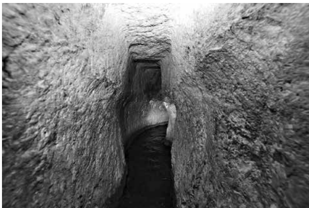
Figure 1.2. Hezekiah's tunnel

Whether or not the tunnel was originally carved in the eighth century BC at the instigation of Hezekiah, it certainly existed well before the first century AD and was a strategic feature of the city. The problem for Jerusalem was that its main source of water was outside the city walls; the tunnel gave protected access to the water in case of siege (for Hezekiah, Sennacherib's siege in the eighth century).