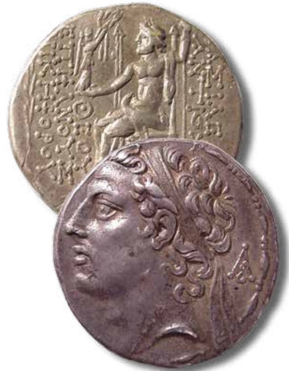
Figure 2.3. A silver tetradrachm of Antiochus IV. The image on the obverse bears a portrait of the king; the reverse bears an image of Zeus, seated with "Victory" standing in his hand. The inscription reads "of King Antiochus, God Manifest, Bringer of Victory."

the safety of Israel, lest this newest movement lead to God's wrath on the nation that was slow to declare its absolute allegiance to Torah. Attempts to pursue the "hope of Israel" through assimilation, therefore, encountered greater