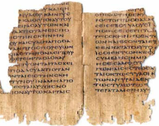
Figure 2.2. A well-preserved codex leaf from the Septuagint translation of Exodus, written on papyrus and bearing a resemblance to the Alexandrian textual tradition of Exodus. The page would have been folded in half as part of a bound volume, with the right page coming first. The right page contains most of Exodus 26:22-25; the left page contains Exodus 30:19-21.

The stage was set for radical action. While Antiochus IV was pressing an attack on Egypt, a false rumor spread that he had been killed in battle. Jason seized the opportunity to rally his supporters and drive Menelaus into the citadel of Jerusalem. The local population, however, also seems to have used this occasion to rid themselves of both problems—driving Jason out of Jerusalem and keeping Menelaus, who had made himself utterly abominable by raiding the temple treasury to pay the promised bribes to Antiochus, besieged in the citadel. 7 Menelaus got word to Antiochus IV, who treated