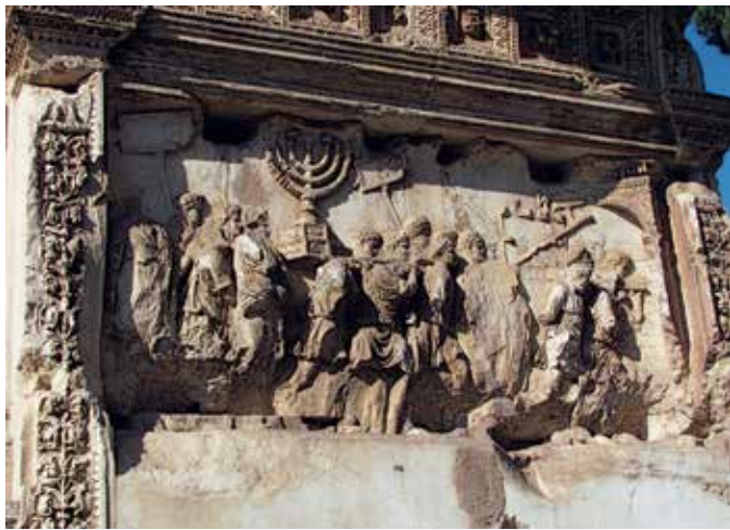
Figure 2.16. The Arch of Titus, a monument erected in Rome to celebrate the achievements of Vespasian's oldest son, emperor 79–81 CE. Prominent among the decorations is a relief sculpture of the treasures of the Jerusalem temple (including the iconic menorah, the table of the showbread, and the ceremonial trumpets) being carried away by Roman soldiers, with Jewish captives in their train.