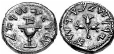
Figure 2.12. The minting of native silver coinage signaled Judea's intention to regain its political independence. This shekel was minted in the first year of the Jewish Revolt (66 CE). The obverse depicts a chalice with the inscription "Shekel of Israel." (The date is above the cup.) The reverse shows three pomegranates surrounded by the inscription "Jerusalem Is Holy," showing the connection between "holiness," "belonging to God," and the ideology of revolt.

As Judea was an imperial province, Roman legions were stationed therein. It is quite natural then that soldiers and their officers would be encountered in the Gospels and Acts (e.g., the centurions in Lk 7:1-10 and Acts 10:1-48) and regarded as suitably well-known