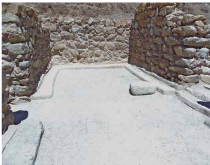
Figure 2.18. The study room from the compound at Qumran. Members of the sect took turns throughout the four watches of the night praying and studying the Torah and other sacred writings in this area.

Their observance of the law was so strict that the sect member did not even defecate on the sabbath, since digging the required hole would constitute work. They would probably not have agreed with Jesus' statement that "the sabbath was made for people, not people for the sabbath" (Mk 2:27). They also pursued a high degree of ritual purity, performing ritual purifications before prayer and before the daily community meal. The Qumran facility is equipped with several mikva'oth for these purificatory immersions. The community's diligence in observing