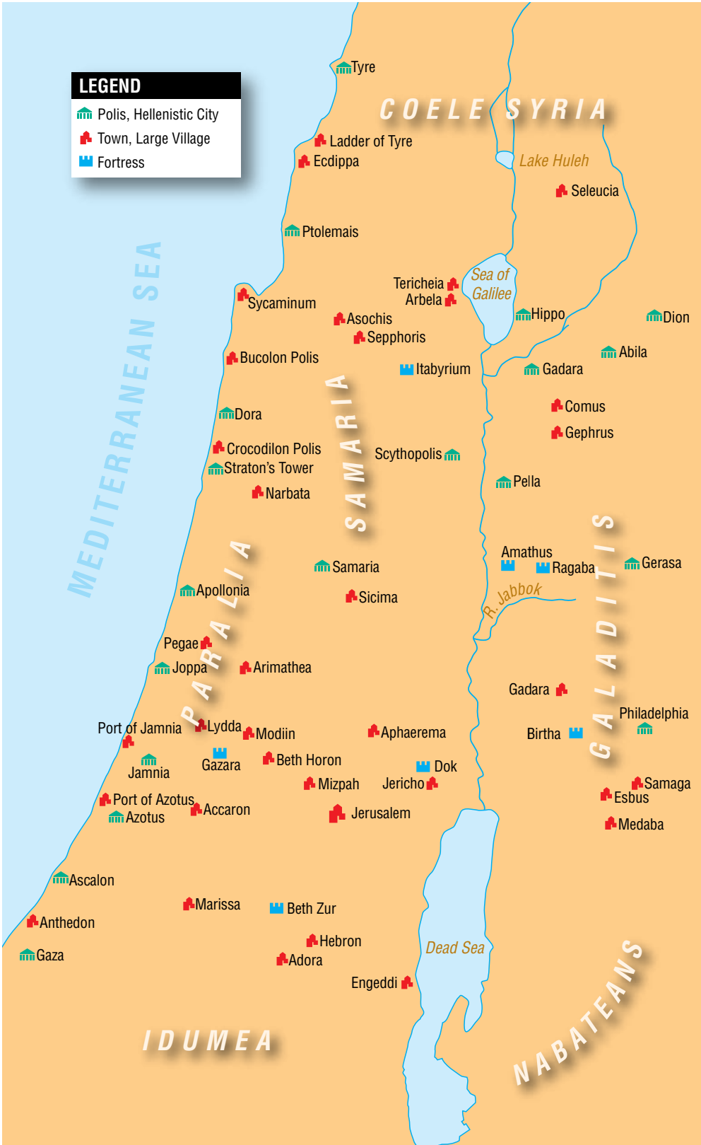
Hellenistic cities in the land of Israel