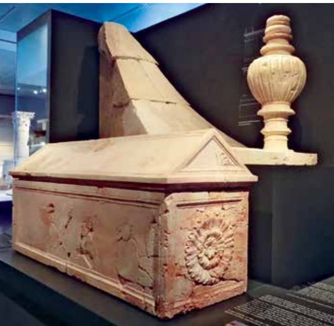
Figure 2.11. Remnants of Herod's mausoleum, discovered along the slope of his fortress-palace at Herodion, along with the reconstructed sarcophagus.

Herod), Augustus essentially upheld Herod's will. Archelaus became ethnarch of Judea, Samaria, and Idumea (4 BCE–6 CE); Herod Antipas became tetrarch of Galilee and Perea (4 BCE–39 CE); and Philip became tetrarch of Iturea and Trachonitis (4 BCE–34 CE). Archelaus was a brutal ruler, quelling distur-