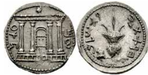
Figure 2.5. Silver tetradrachm (called a sela ) from the second year of the Bar Kokhba Revolt (133/134 CE). The obverse shows the face of the Jerusalem temple with the ark of the covenant visible within and bears the inscription "Shimon," for the leader of the revolt. The reverse features a lulav and an etrog , symbols of the Feast of Sukkoth (Booths), and bears the revolutionary inscription "Year Two of the freedom of Israel."

This vision of and strategy for attaining the hope of Israel culminated in the two disastrous revolts against Rome, the first in 66–70 CE and the second in 132–135 CE, the revolt of Bar Kosebah, whom Rabbi Akiba hailed as Bar Kokhba, "son of a star," the Messiah (and, after the defeat, Bar Koziba, "son of a lie"; see fig. 2.5).