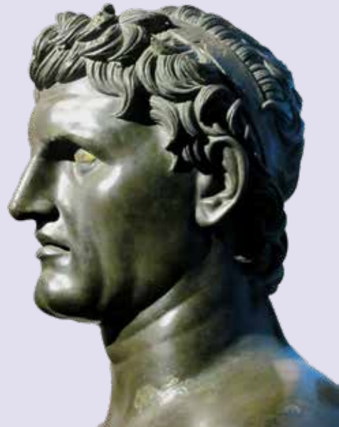
Figure 2.4. Bronze bust of Seleucus I Nicator from the "Villa of the Papyri," Herculaneum. ( Naples Museum )

began to purge Judea by attacking Jews who had abandoned observance of the boundary-keeping commands of Torah. Boys left uncircumcised were forcibly circumcised; Jews who had accommodated too far were left to fear for their lives (1 Macc 2:44-48; 3:5-6). The threat was not taken sufficiently seriously by the Greco-Syrian government, with the result that insufficient forces were dispatched at first to crush the revolution. This resulted in some early victories that fueled the fire of resistance, supplied the growing rebel army with weapons and armor, and demoralized the Syrian occupying forces, more or less setting the tone for the campaigns that followed.