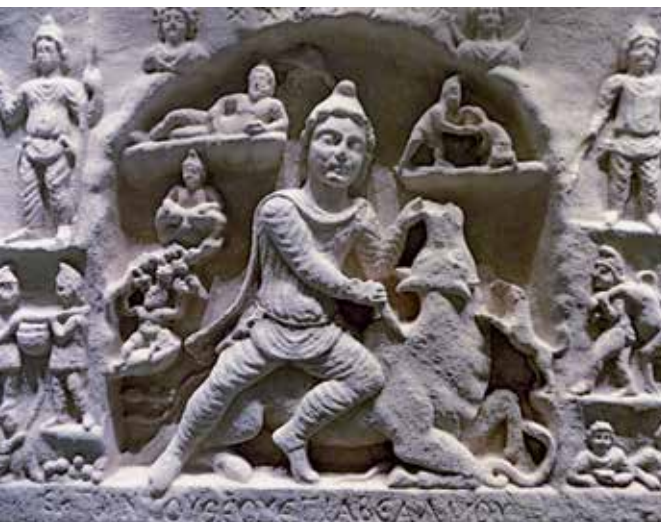
Figure 2.21. A second-century-CE representation of Mithras slaying the bull, the central element of the myth of the mystery cult bearing his name. ( Israel Museum )

The Christian gospel, therefore, was also very much a sociopolitical proclamation, an aberration, a dissenting voice. Even though it generally called for obedience to political authorities, it nevertheless threatened the sociopolitical order by calling its religious foundations into question as well as by calling it a temporary arrangement awaiting replacement by the order (the "kingdom") of the one and only God. The Christian gospel presented a grave affront to Roma Aeterna and to all who found security and peace under her wings. By withdrawing from all settings where another god would be venerated, the Christians appeared antisocial.