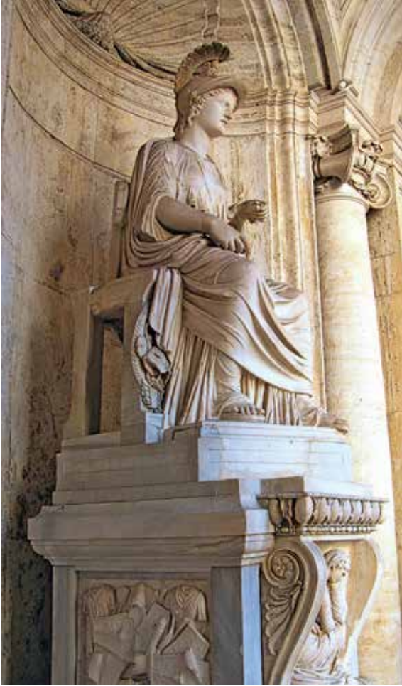
Figure 2.8. A cult image of the goddess Roma. (Capitoline Museum, Rome)

to John the Revelator, who sees Rome as the arrogant enemy of God. Both, however, see Rome as temporary, and that was enough of a political statement to make the Christians' neighbors uncomfortable.