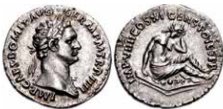
Figure 2.10. A silver denarius of Domitian celebrating his suppression of a rebellion in Germany, which appears on the reverse, personified as a mourning Germania.

Domitian was murdered by conspirators and left no heir. An old senator, Nerva, acceded to the imperium and adopted as his son a strong general from Spain named Trajan, under whom the empire reached its greatest size and under whom Christians were for the first time legally prosecuted. An especially poignant testimony to these proceedings is to be found in the correspondence of Pliny the Younger ( Ep. 10.96), senatorial governor of Bithynia and Pontus in or around 110–112 CE,