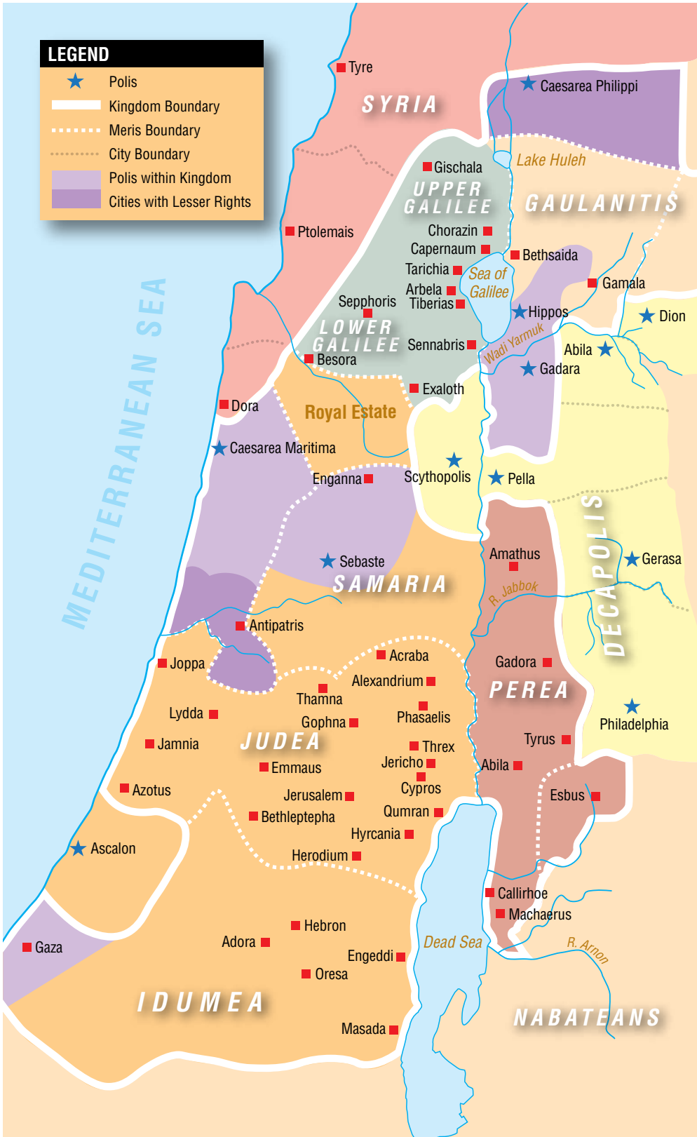
Roman and Herodian Palestine