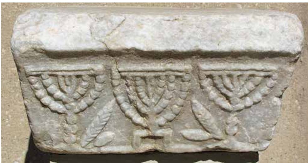
Figure 2.17. A capital from a pillar from the late Roman period Jewish synagogue in Corinth. The carvings feature menorahs, palm branches, and etrogs (a citrus fruit used in connection with the Feast of Booths). Synagogue decorations across the Mediterranean often feature such decorative connections with the temple and its cult.

The synagogue. While the temple served as the formal and symbolic center for Jewish religious life, going to the temple was in fact a rare privilege for the majority of Jews. When Diaspora became a reality for significant Jewish populations, Jews began to meet together on the sabbath in order to enjoy regular interaction around their sacred Scriptures. The place in which they met came to be known as a “prayer house” ( proseuchē ) or “assembly” ( synagogē ; see fig. 2.17). The synagogue functioned also as a sort of local court, regulating internal Jewish affairs. The synagogue rose to a place of importance within Palestine as well, every village having a designated place for