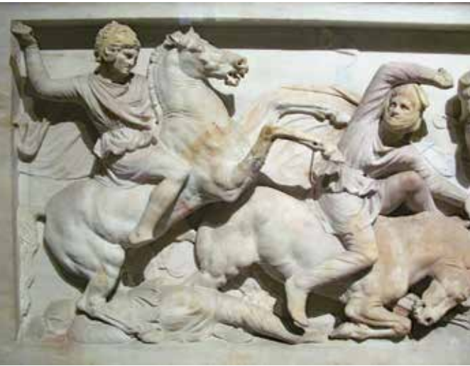
Figure 2.1. Alexander the Great riding down Persian soldiers. Detail of a frieze from a sarcophagus from Tyre.

culture; theaters, stadia, and hippodromes, for the enjoyment of Greek forms of entertainment (the first of which, incidentally, was an important venue for Greek thought, poetry, and music); and temples, for Greek forms of worship. Through his efforts the influence of Greek culture was felt in cities throughout the known world. 1