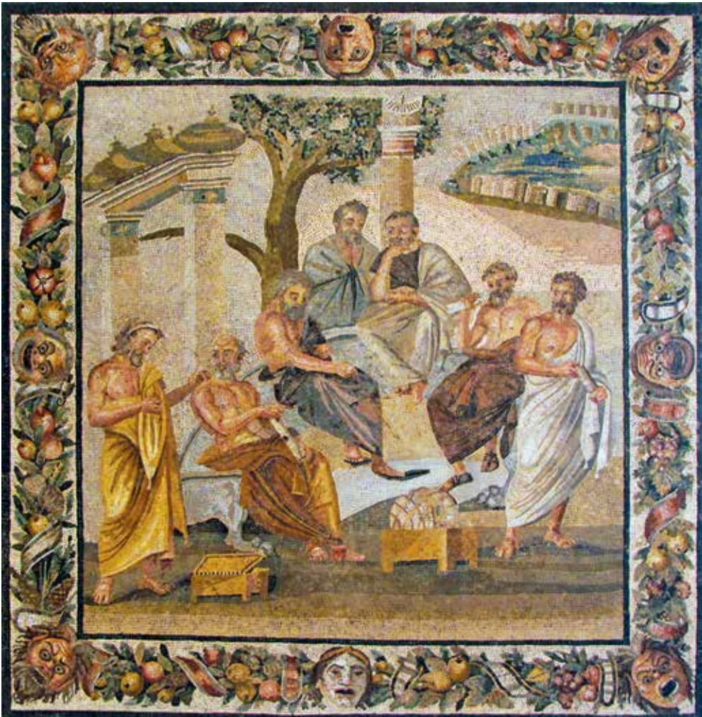
Figure 2.23. A mosaic from a villa in Pompeii depicting Plato's Academy. (Naples Archaeological Museum)

Platonism. Plato, a disciple of Socrates and founder of an academy in Athens (see fig. 2.23),