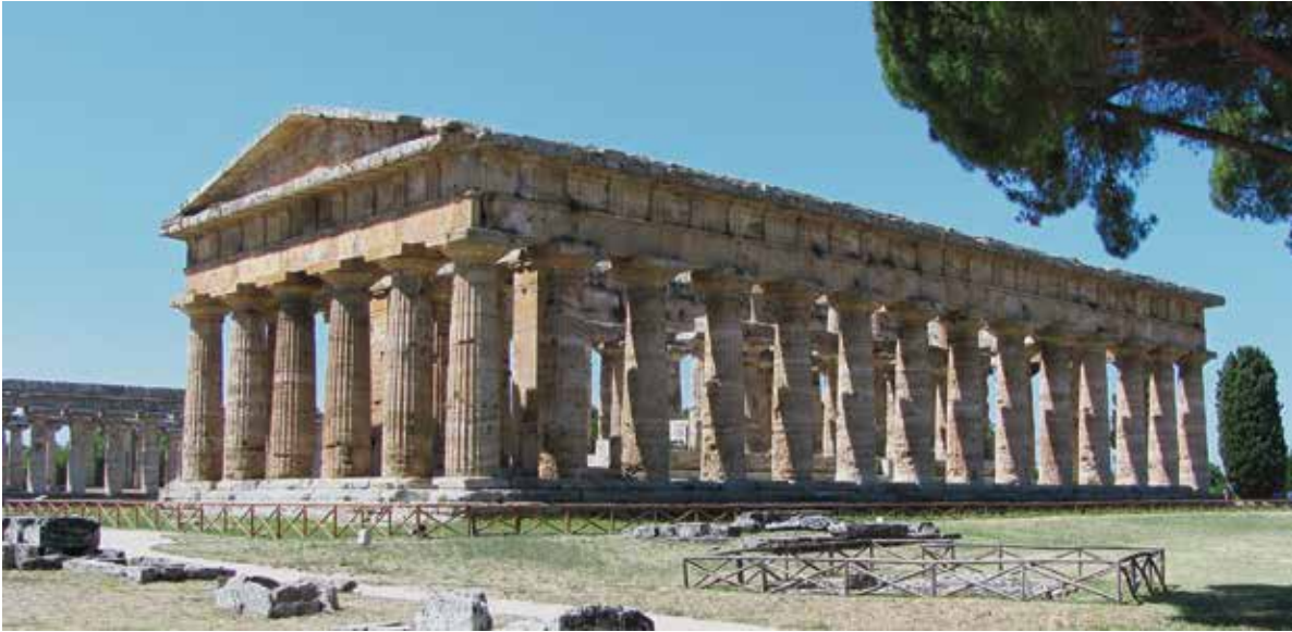
Figure 2.20. A well-preserved, monumental Greek temple in Paestum, Italy. Numerous such temples were found in every major city. Sacrifices were performed on altars located in front of the temples, with the worshipers gathered respectfully outside the god's house.

Greco-Roman religion (as also in ancient Israelite religion). Individuals promised a particular sacrifice or gift in return for some favor sought from a god; paying the vow then became a witness to the benevolence of the deity.