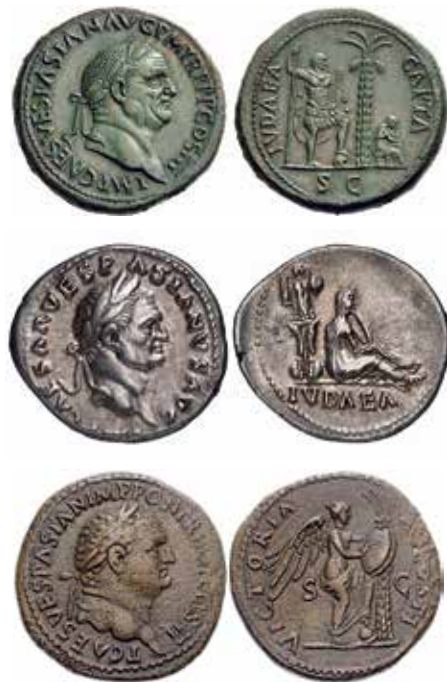
Figure 2.9. Three coins minted to commemorate the Flavian dynasty's pacification of the Jewish Revolt of 66–70 CE. The first coin is a bronze sestertius of Vespasian, the reverse of which shows a personified Judea mourning beneath a palm tree with a Roman soldier looking on. The inscription reads "Judea Taken" or "Judea Secured". The second is a silver denarius of Vespasian, with the reverse featuring Judea sitting in the shadow of a Roman trophy, showing the helmet, cuirass, swords, and shield of the Roman legionnaire. The third is a sestertius of Titus, with a reverse featuring winged Victory inscribing words on a Roman shield hanging on the iconic date palm of Judea. Such shields often bore abbreviated inscriptions such as "Vic[tory over the] Dac[ians]." She stands with her left foot on a ball, representing the globe that remains under Rome's foot because of her victories.

Assessment of Domitian is very difficult, for the major sources for his rule (written by Tacitus, Suetonius, Pliny the Younger) were written by