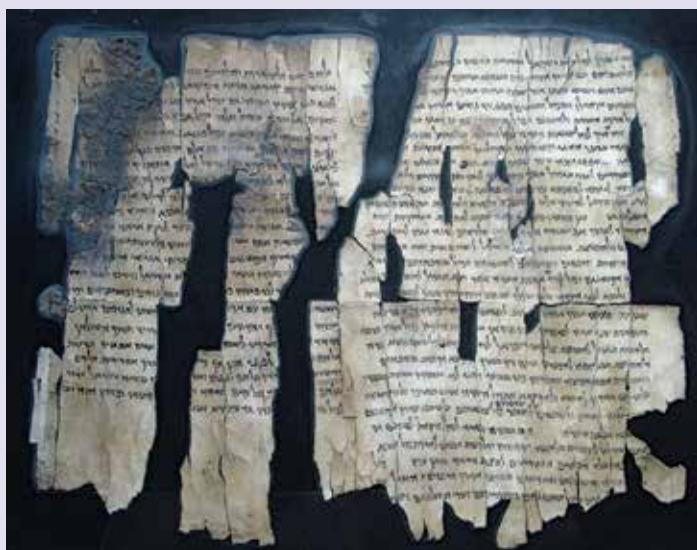
Figure 2.19. A fragmentary copy of the Community Rule (1QSa), the document that appears to have regulated the life of the community at Qumran, covering everything from the process of examining and assimilating new members to community officials' roles and responsibilities to discipline within the sect. ( Jordan Museum )

The second category includes books that were not included by most Jews in the Bible but also were not the peculiar products and