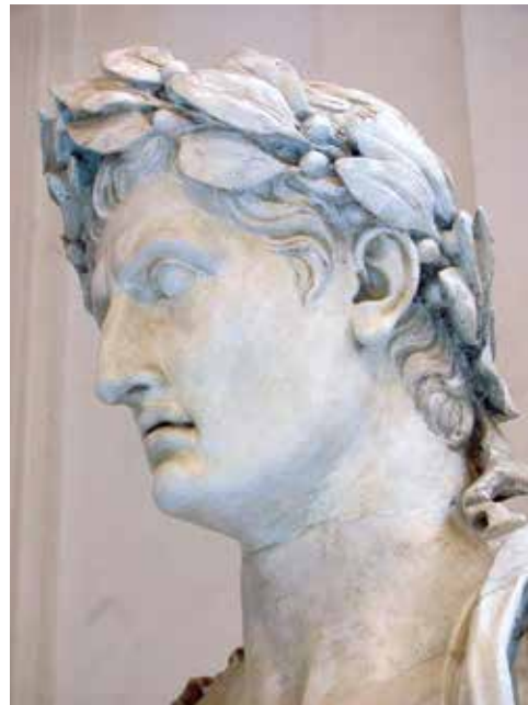
Figure 2.6. Head of Augustus from a larger-than-life seated statue of the emperor, discovered in the Augusteum at Herculaneum.

any future civil wars and the incredible loss of property, security, and life that accompanied them, the senate and people of Rome gave Octavian the imperium , the right to command the legions of the empire, 10 and made him perpetual consul. Octavian thus concentrated all power in his hands through constitutional, “Roman” means, unlike his adoptive father, Julius Caesar (who had sought the title “Dictator in Perpetuity”). He was given the title “Augustus,” which designated him both as “pious” and as “worthy of reverence,” and named Pontifex Maximus , the high priest of the official religious life of the Greco-Roman world (see fig. 2.6).