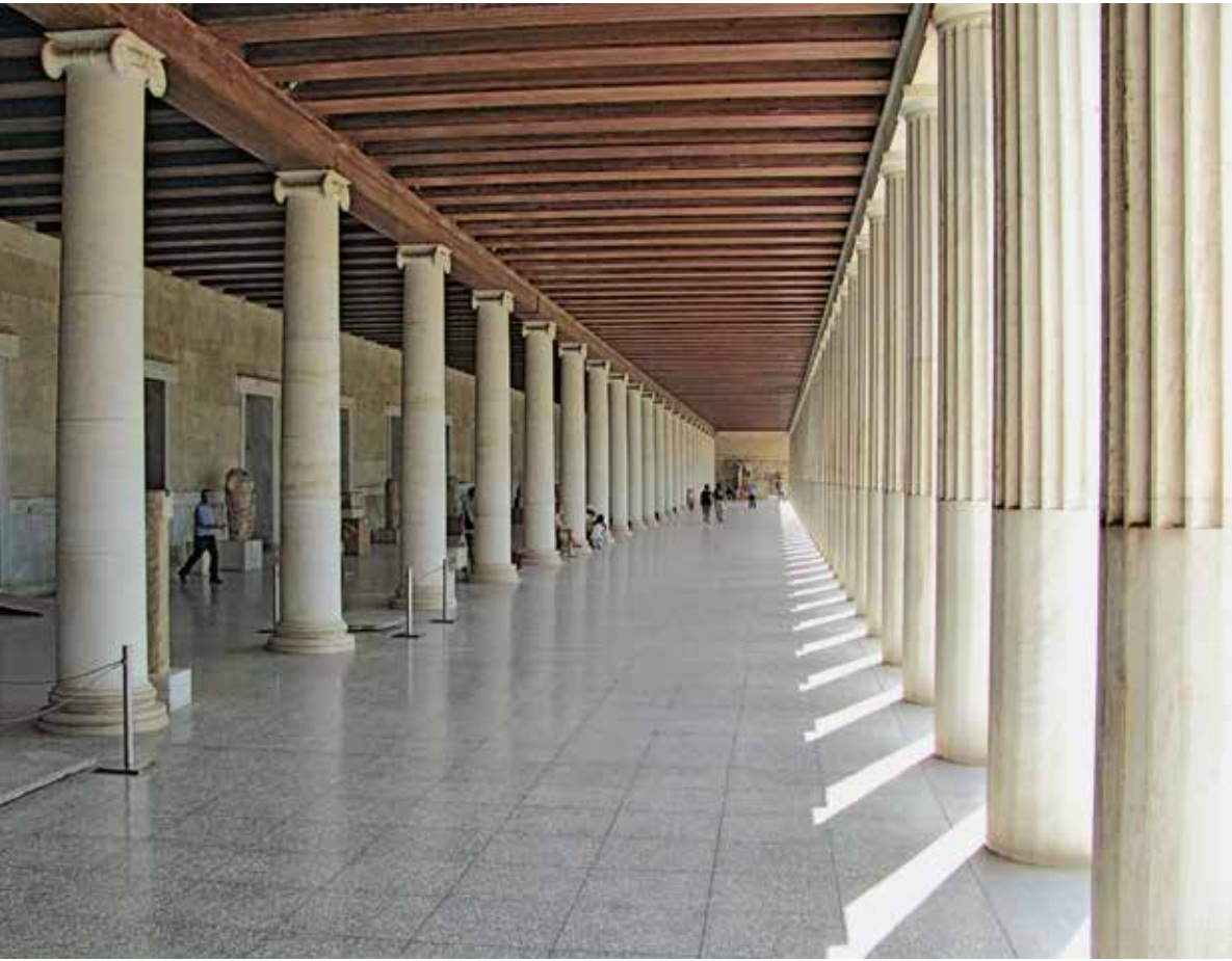
Figure 2.24. The reconstructed Stoa of Attalus in the Athenian agora. Stoics were so named because their founder, Zeno of Citium, expounded his teachings in a similar colonnade in the agora known as the Stoa Poikilē (the Painted Colonnade).

befell his body or reputation, all that really mattered to him was gaining Christ and being faithful to God. This enabled Paul, however, to remain essentially free, as the Stoic would define freedom. No external necessity or compulsion could deter him from acting in accordance with his own moral purpose.