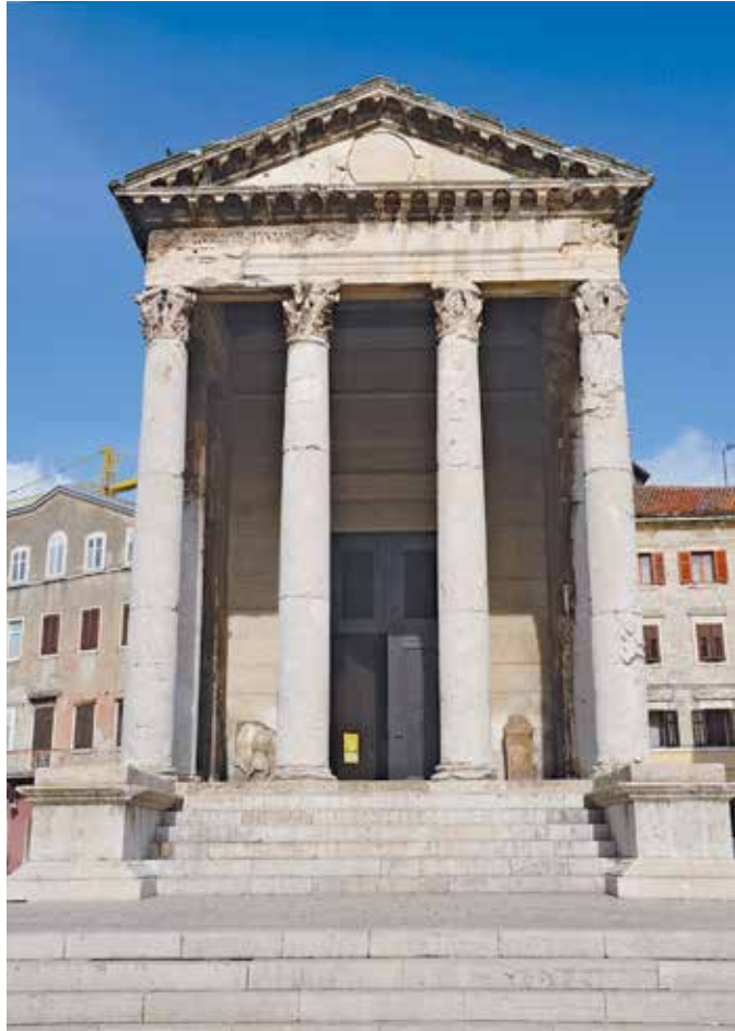
Figure 2.7. The temple of Roma and Augustus from Pola, modern Croatia. Such temples were erected throughout the Roman Empire during and following Augustus's reign (31 BCE–14 CE).

Roman imperial ideology centered not only on the person of the emperor but also on the city of Rome, which was worshiped alongside the emperor as Roma Aeterna (see fig. 2.8). Rome was the city destined by the gods to bring their order to the world and to rule forever. She was the bringer of peace, wealth, and security