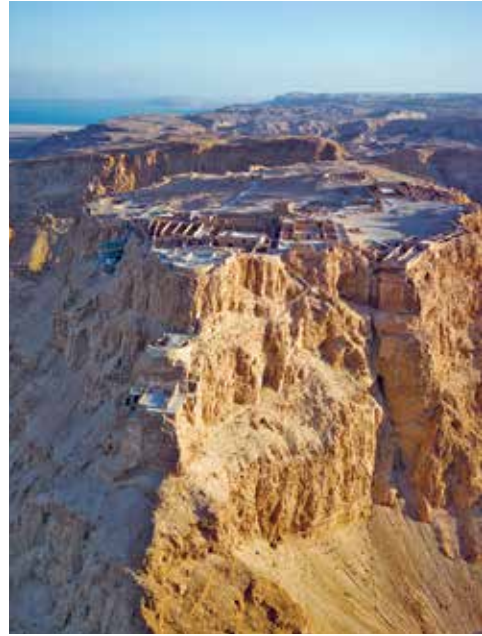
Figure 2.14. The fortress of Masada, first a Hasmonean and later a Herodian border defense. The fortress was well fortified and armed, and well stocked with food and water; Judean revolutionaries held out here for three full years after the fall of Jerusalem in 70 CE.

center. The second temple had functioned as the place where God met Israel and the divine-human relationship could be repaired and enacted for almost six hundred years (with the brief disturbance of 167–164 BCE). So momentous were these events that Luke regarded