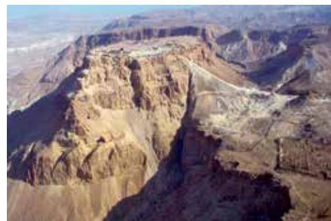
Figure 2.15. The mountain fortress of Masada. The Roman army, no doubt along with many Jewish prisoners of war, laboriously constructed a ramp against the side of the mountain atop a natural debris tongue so that it could bring its siege ladders and battering ram against the walled palisades at the top.