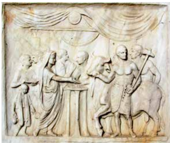
Figure 2.22. The interior of the sacred precincts of Vespasian in the forum of Pompeii. A small altar sits before the small temple that housed the cult image of the emperor. The altar features a typical sacrificial scene involving a tripod bearing fire, over which incense, grain, or wine is being offered by the priest, and a bull being prepared for sacrifice.

people to imitate the gods, but in doing so they had to be selective in the points of imitation. Seneca, for example, frequently urged those who would give benefactions to others to imitate the gods, who give good gifts to both the good and the bad because it is in their nature to be generous, not because they are looking for a return on their investment. 25 However, it would not do to imitate the gods' sexual