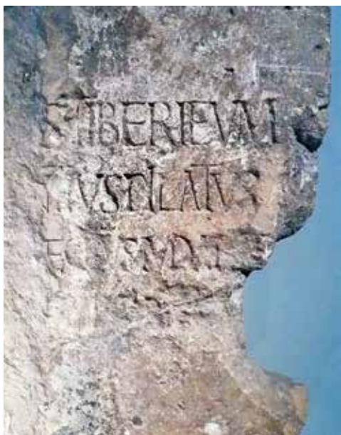
Figure 2.13. A partial inscription mentioning Pontius Pilate in connection with the dedication of a shrine to the emperor Tiberius in Caesarea Maritima. This is the only archaeological reference to Pilate.

activity points to the extremely volatile nature of Judea during this period. Roman rule was viewed increasingly as unacceptable and incompatible with allegiance to God. Also noteworthy is the intentional imitation of biblical