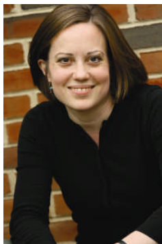
Jenell Williams Paris

$15, 180 pages, paperback, 978-0-8308-3836-3